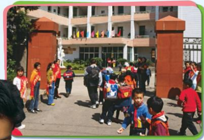
Some school buildings in Asia are tall, like this one.

All around the world, children go to school. Some children spend most of their day at school. Others spend only a few hours there.