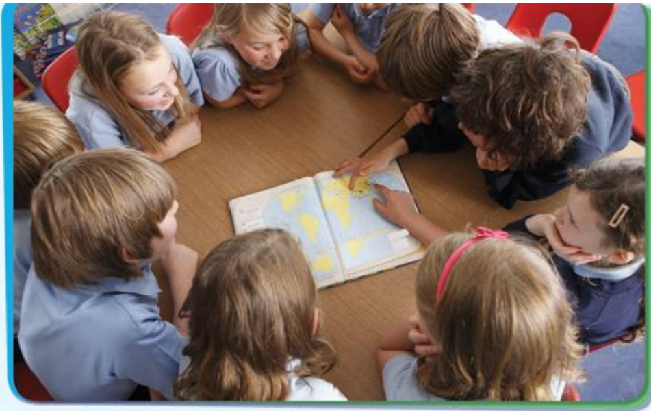
At an American school overseas, students study a map of Europe.