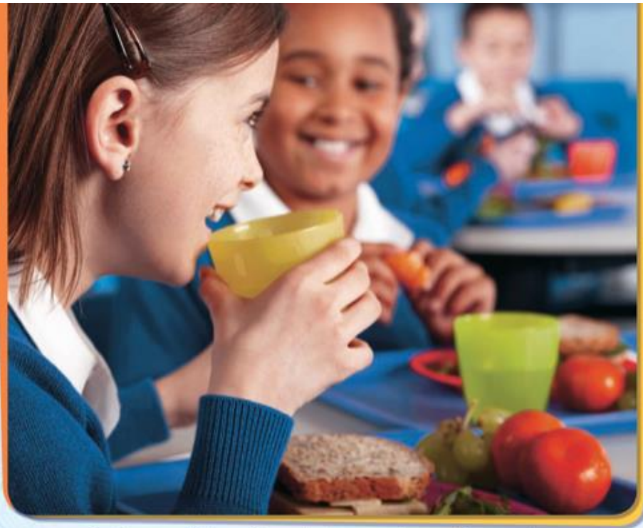
Students at this boarding school eat, study, and live together.