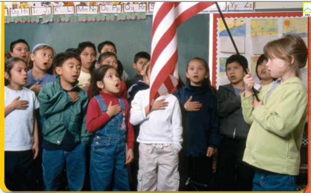
These students in an American classroom start their day by saying the Pledge of Allegiance.

Schools are different in different parts of the world. But they are all the same in one way. Schools are where children go to learn.