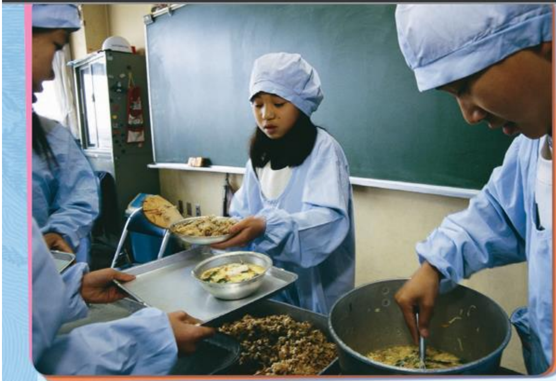
In this school in Japan, students help serve lunch.