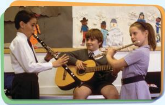
These students in Great Britain practice playing music at school.

Many children around the world study art and music in school. They may also learn how to use a computer.