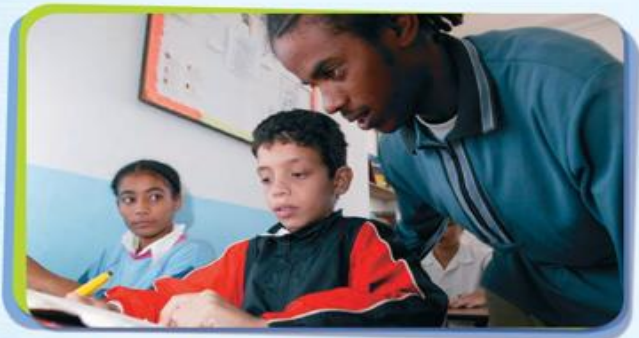
This teacher answers a question for his student at a school in Cuba.