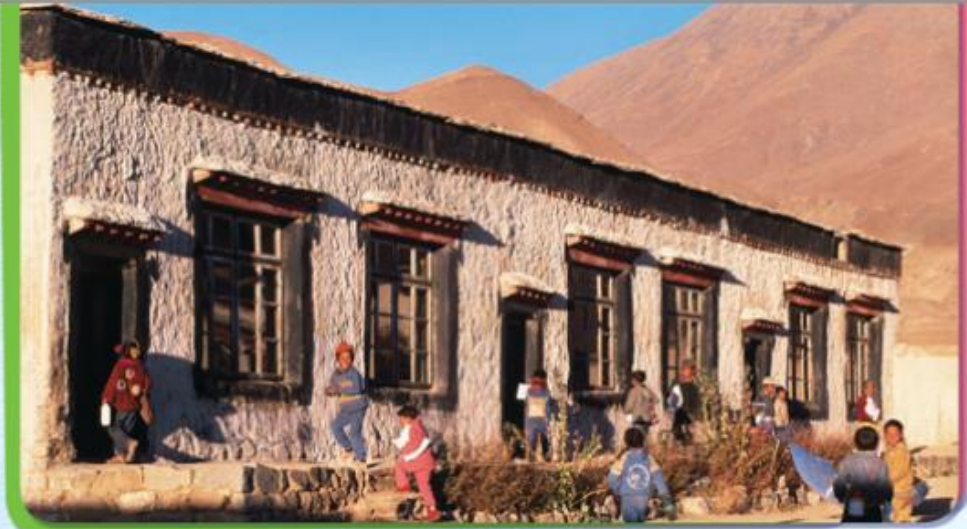
These students in Tibet, China, are about to start their morning classes.