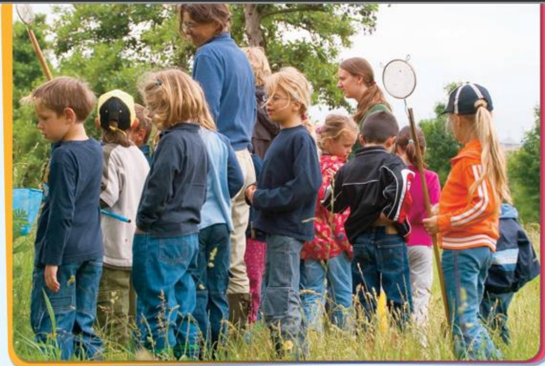
These students in Germany are learning science on a class trip with their teachers.