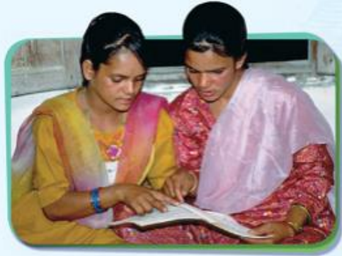
These women in India go to school at night.